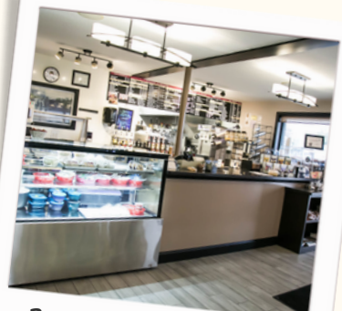
Roselen's Coffees & Delights

End your day with Christmas lights under the stars. Aiƙman's is host to over 220 animals comprised of over 90 different species native to six different continents. The park is completely transformed for the season & filled with hot chocolate stations, animal encounters, and yultide cheer!