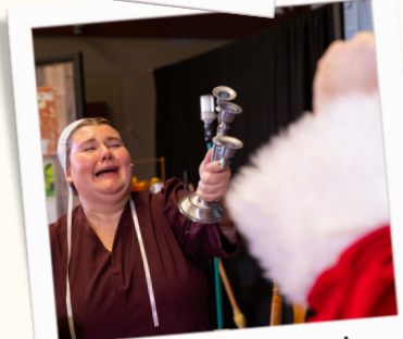
Live Theatre at Penn Station