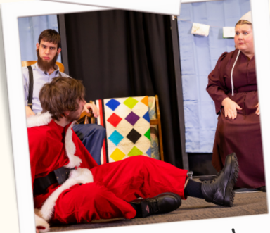
Live Theatre at Penn station