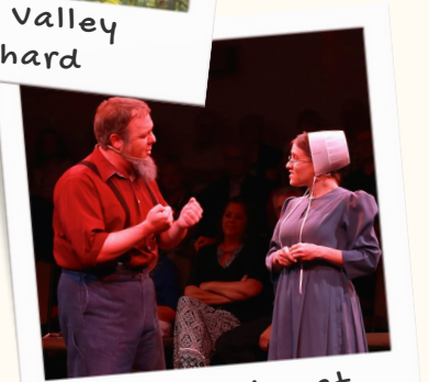
Live Theatre at Penn Station