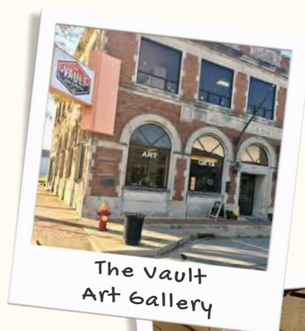
The Vault Art Gallery