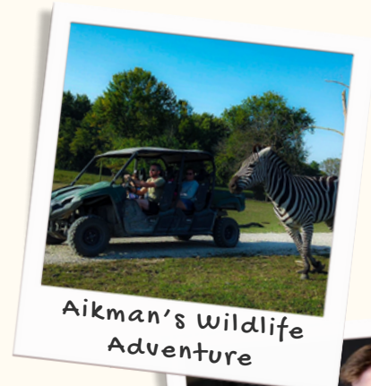
Aikman's Wildlife Adventure

Stores Included: Frenchie's Boutique, Yoder's Antiques, Astoria Products, Amish Country Heirlooms, Homeplace, Jerry Winter's Art Gallery, Stich & Sew Fabrics, The Woodloft & Shady Crest.