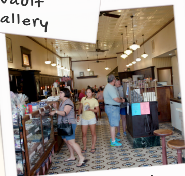
Flesor's Candy Kitchen