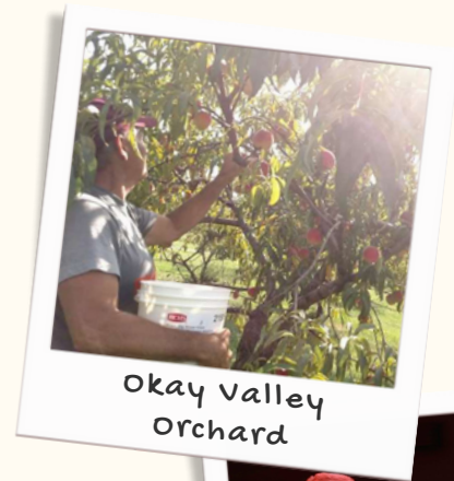
Okay Valley Orchard

After lunch, indulge in the splendor of an enchanting afternoon as you immerse yourself in the captivating world of family-friendly live theatre within the heart of Amish Country.