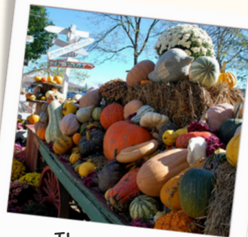
The Great Pumpkin Patch

Conclude your day with a touch of culture and history by exploring the captivating murals of Arcola and taking a tour of the Historic Train Depot.