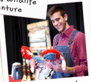
Live Theatre at Penn Station