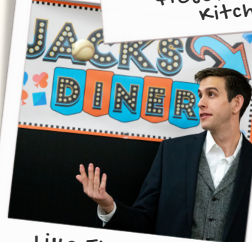
Live Theatre at Penn Station