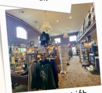
Yoder's Gift Shop