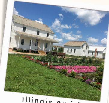
Illinois Amish Heritage Center

Yoder's Kitchen has it all- famous fried chicken, mashed potatoes and gravy, noodles, and more on the hot buffet, plus salad bar, dessert bar, and ice cream. It's no wonder this restaurant was voted one of America's Best Restaurants in 2022. With these delicious Amish recipes, sit back, fill up and relax. You're in their kitchen now!