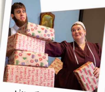
Live Theatre at Penn Station